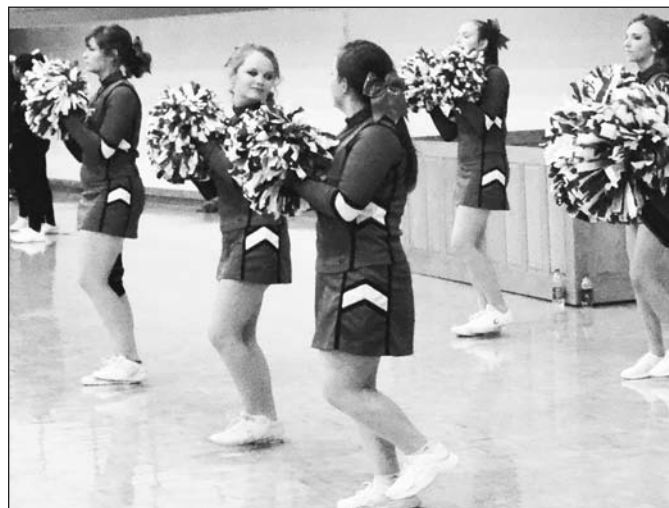
Towns County girls basketball