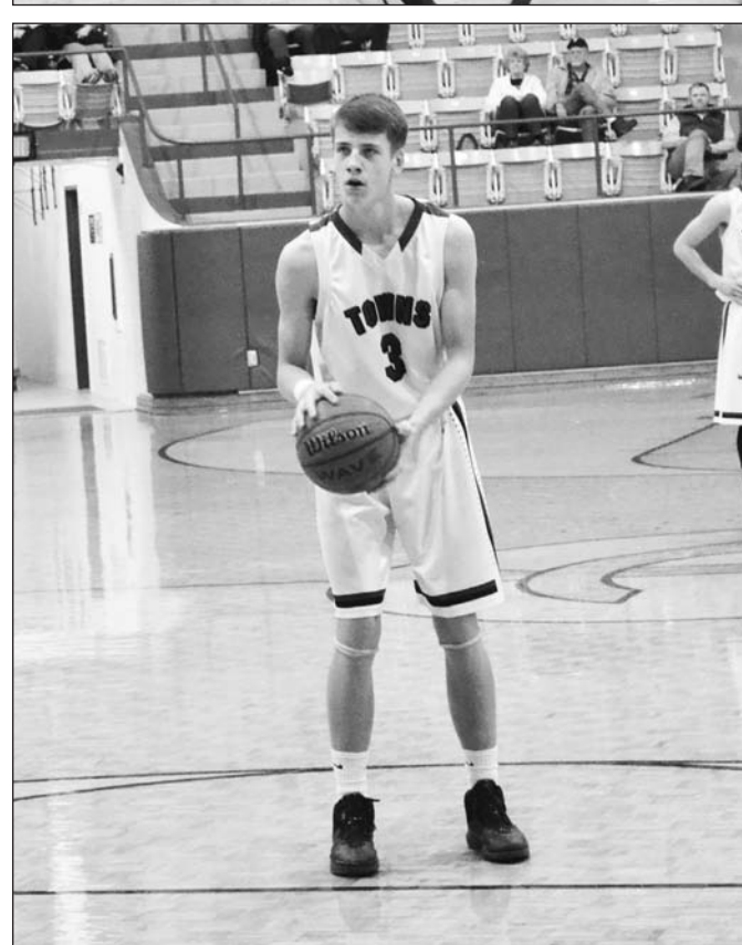
Towns County boys basketball